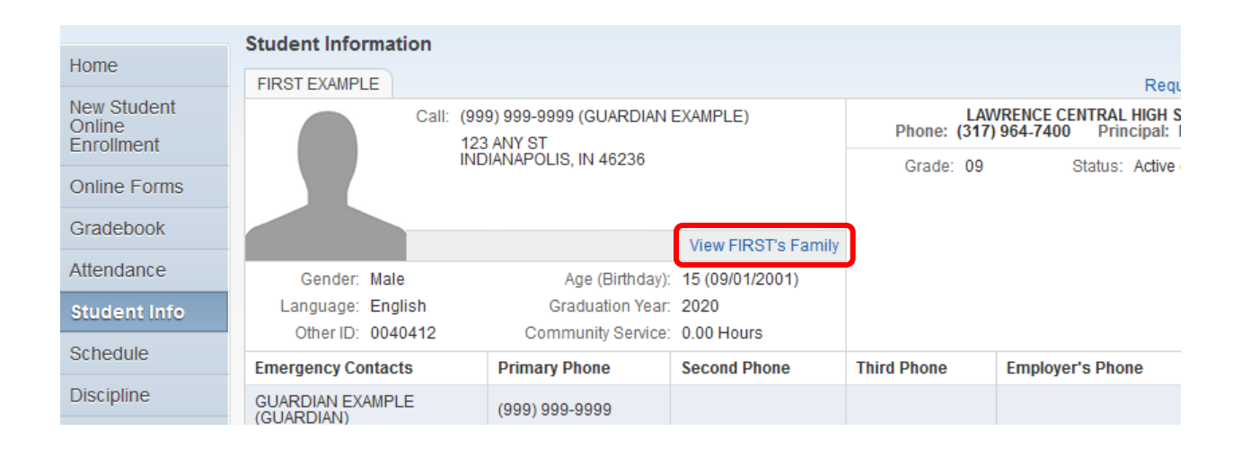
Step 4: A Pop-Up window will appear and you can retrieve your Family ID from this window. You will use the Family ID as your login to the Transportation website (see below). Please note that the Family ID is the same for all students attached to your family. You will not need to access each Student Family page.